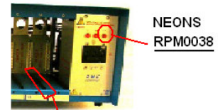
NEONS RPM0038 Smart Series Mainframe Card Guides RPM0044