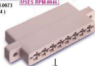
Edge Card Connector Kit for all Mainframe PC Boards (10, 15 or 30 AMP) CKF-312-G (SEE ALSO RPM-0046 - THIS IS ALSO USED FOR "ANTI-ARC" FEATURE EARLIER MAINFRAMES HAD ONLY ONE CLIP MISSING -3RD FROM TOP, PUT EXTRA CLIP IN BY ITSELF FOR MAINFRAME UPGRADES TO USE ANTI-ARC FEATURE - SNAPS IN FROM REAR OF FRAME)