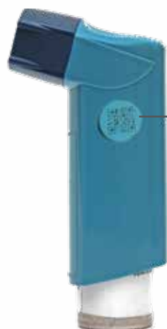
QR Code Insert Size Options (to scale)